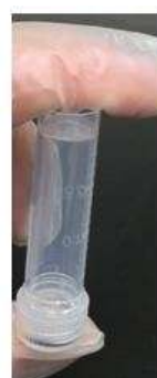
Invert three times